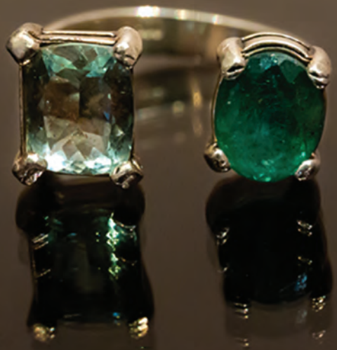
Emerald & Aquamarine ring by Plumb&Co

Craft Class Program details at Eventbrite / The New Artisans Gallery