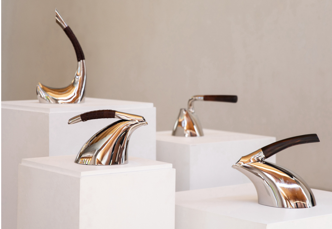
Sean O'Connell's kettles are laboriously formed from stainless steel sheet.